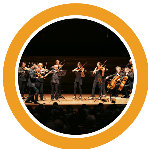
AUSTRALIAN CHAMBER ORCHESTRA October 22nd, 2024

BE MOVED! The 127th season of Troy Chromatic Concerts presenting world-class musicians in our world-class space! Prelude conversations will return for this season.