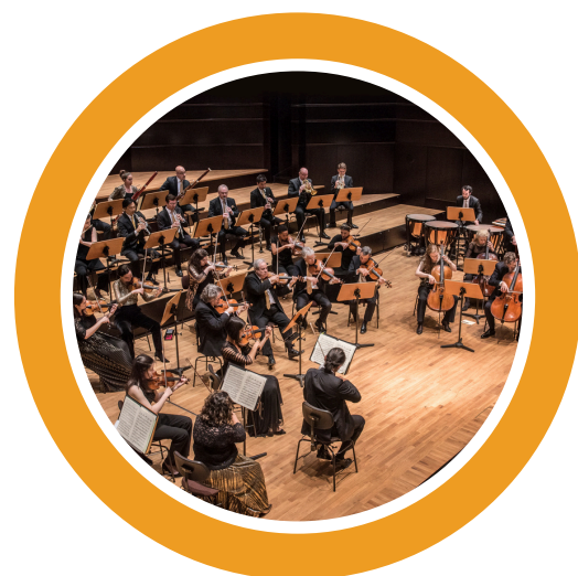
ORPHEUS CHAMBER ORCHESTRA November 3rd, 2024