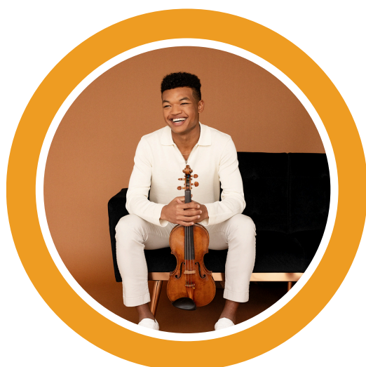
RENAISSANCE QUARTET November 23rd, 2024