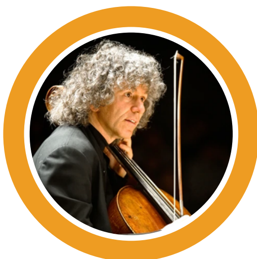
STEVEN ISSERLIS February 4th, 2025